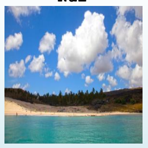
Lake Pehoe -Magallanes